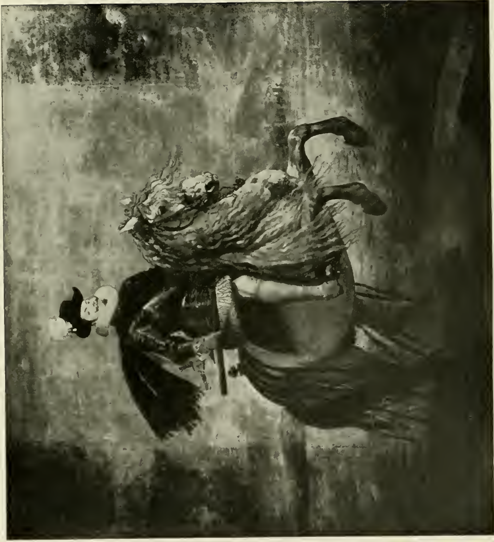
PHILIP III. PRADO, PARTLY REPAINTED BY VELASQUEZ IN MIDDLE PERIOD UPON AN EAR- LIER WORK BY B. GONZALEZ.