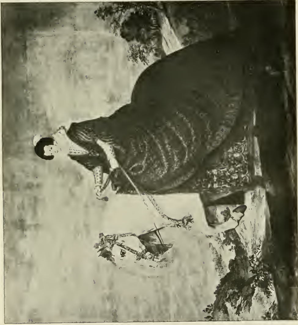
ISABELLA OF BOURBON. PRADO. FIRST WIFE OF PHILIP IV. THE DRESS IS NOT BY VELASQUEZ. MIDDLE PERIOD.